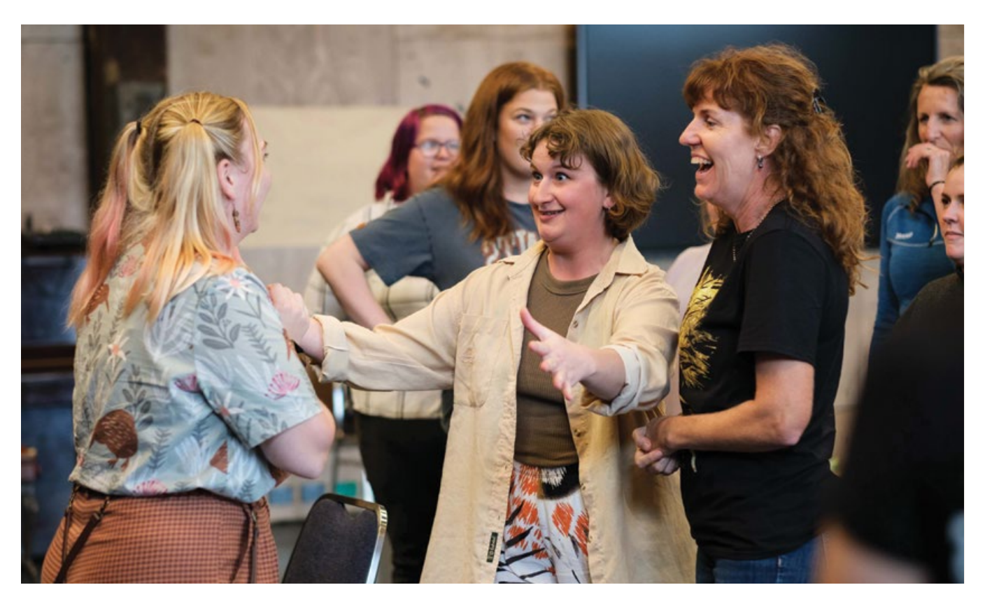
▲ Participants taking part in the Bell Shakespeare mentorship program.

Our long-term partnership with the Credit Union Foundation of Australia (Cufa), an international development agency committed to alleviating poverty and creating sustainable results across the Asia Pacific, continued to address poverty in Cambodia.